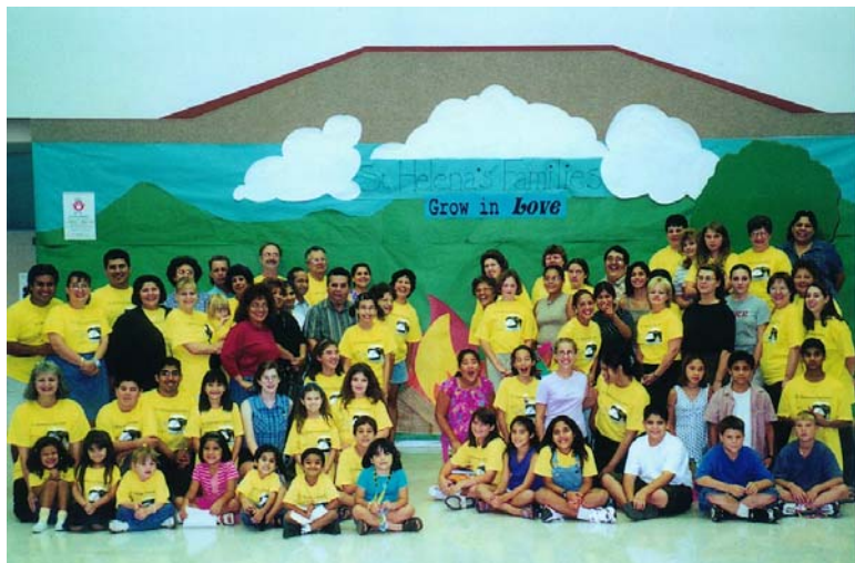
Summer program, Grow in Love , is a joint effort of children, teens and adults.